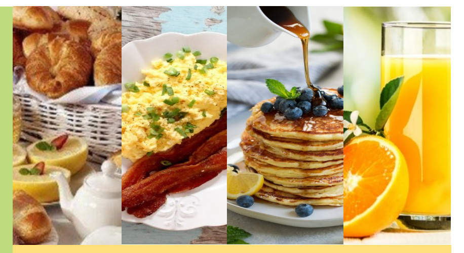
Please join us at the Business Breakfast on June 19, 2019!