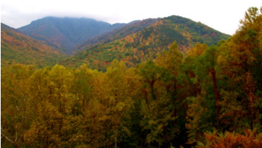
Great Smoky Mountains National Park