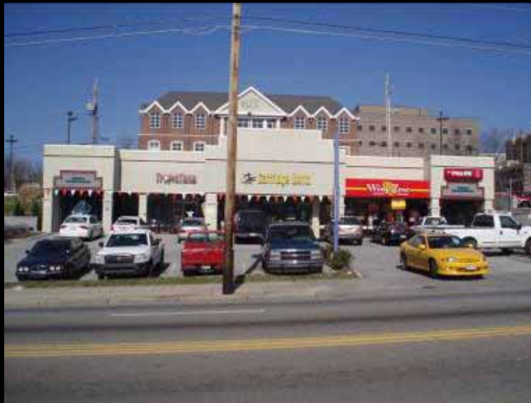
Auto Oriented Development