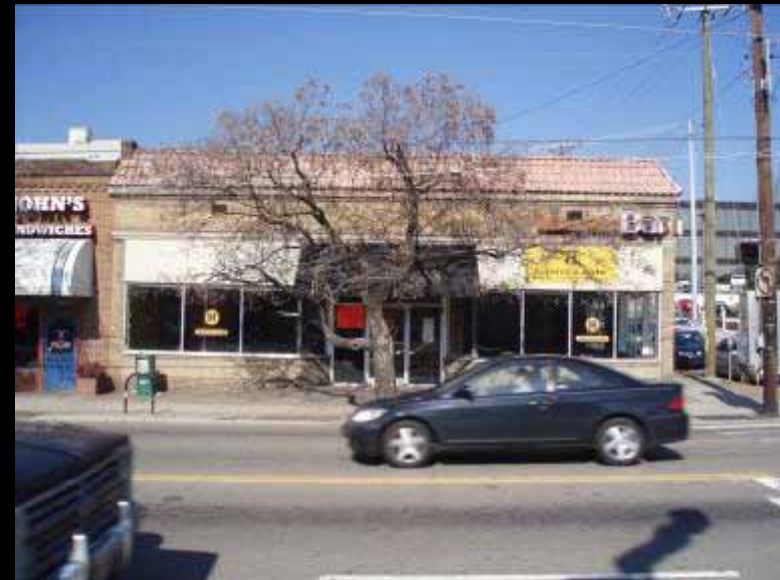
Pedestrian Oriented Development