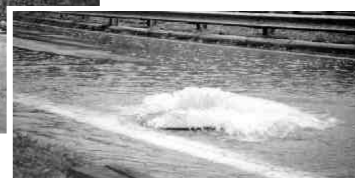
When sanitary sewer systems are not maintained, or lack adequate capacity, discharges of raw sewage and industrial wastewater can occur and potentially endanger the public and environment.