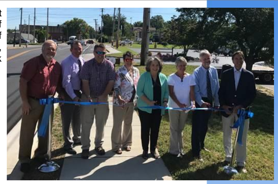
W Young High Pike - Ribbon Cutting - July 31, 2017

Project Description: This project consists of the construction of approximately 1,600 linear feet of sidewalk, pedestrian signals, necessary drainage and grading work along W Young High Pike.