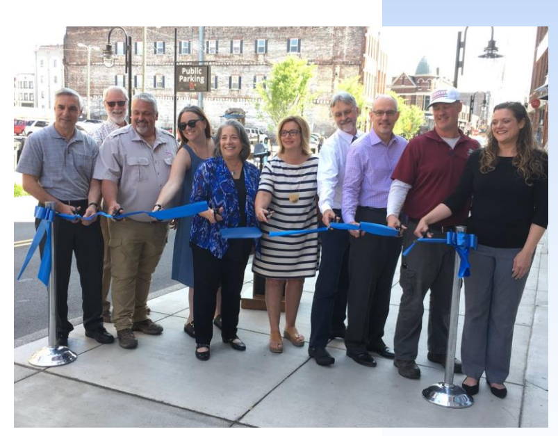
May 24, 2018 Ribbon Cutting Celebrating the completion of two W Jackson Avenue Streetscape projects