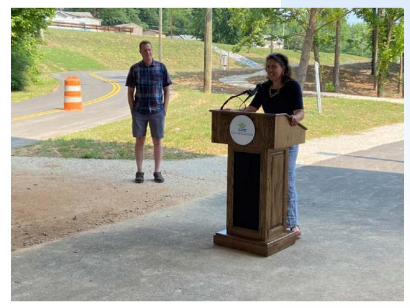
Celebrating Completion of Phase One