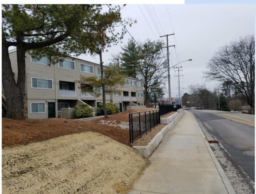
Construction Complete - February 2018