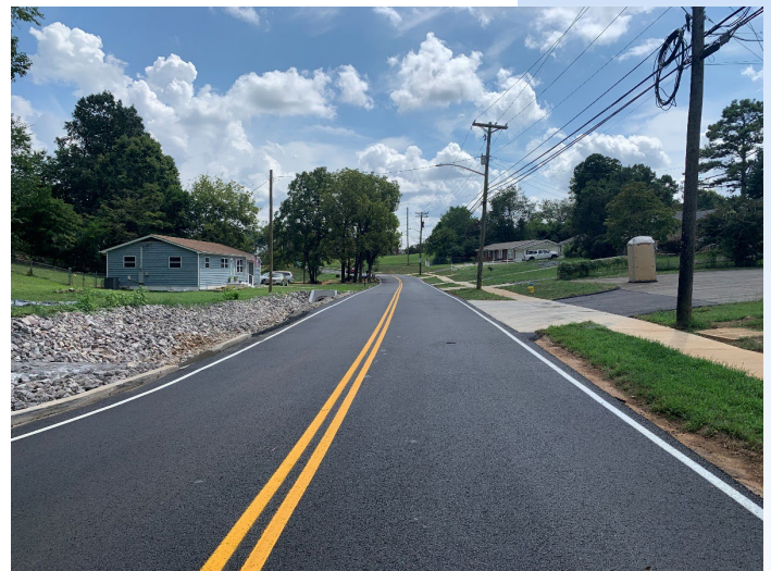
Construction Complete – September 2022 Looking south from 4503 Sullivan Road