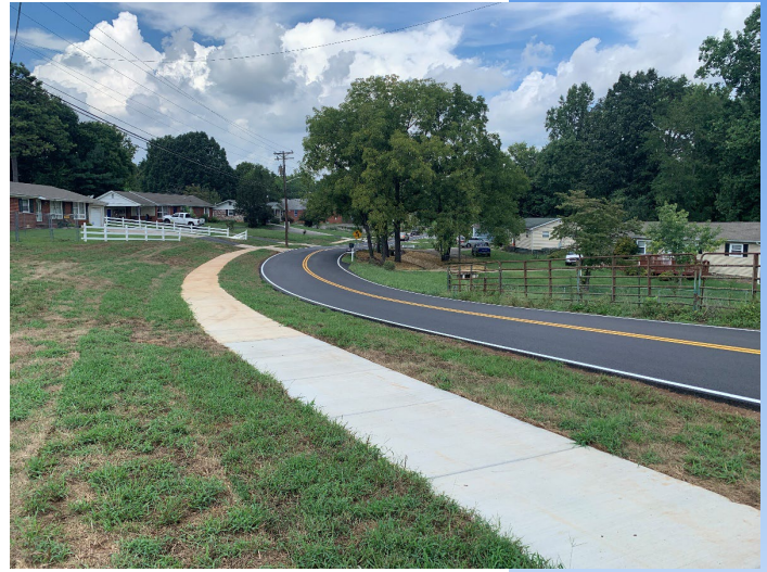
Construction Complete – September 2022 Looking north from 4401 Sullivan Road