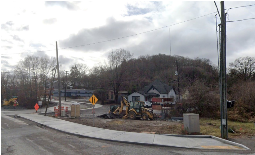
Old Broadway Sidewalks Project During Construction – February 2024

This project provides a multimodal facility that connects Fountain City to the neighborhoods south of Sharps Ridge and separates users from the heavily traveled interchange of Broadway at I-640.