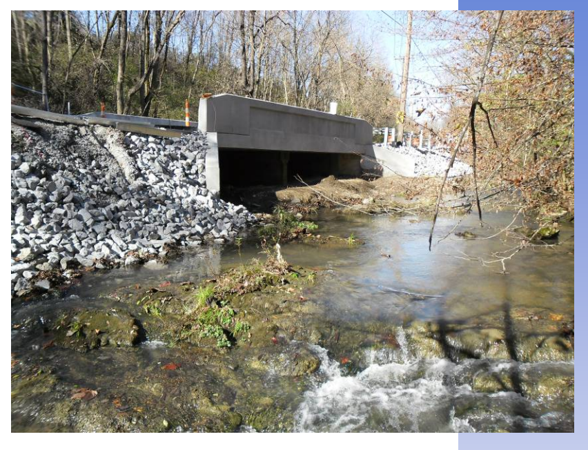
Repaired Loves Creek Road Bridge

Project Description: This project will consist of repairing and updating the substandard features of an existing slab bridge over a branch of Loves Creek.