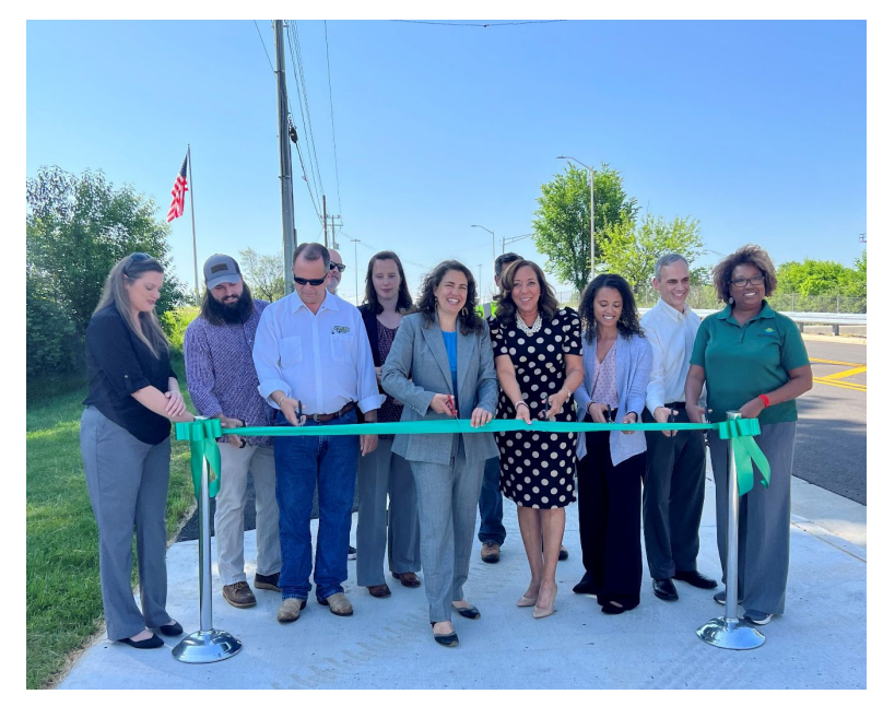
May 10, 2022

Project Description: This project will extend Blackstock Avenue approximately 1,100 feet from W. Fifth Avenue to Bernard Avenue and approximately 1,600 feet north along Marion Street to Baxter Avenue and approximately 325 feet east and 325 feet west along Baxter Avenue. The proposed improvements include a new two-lane road consisting of 11-foot travel lanes, curb and gutter, a five-foot sidewalk, and a 10-foot multipurpose trail from W. Fifth Avenue to Bernard Avenue. Improvements will also be made to Marion Street from Bernard Avenue to Baxter Avenue, including the addition of curb and gutter, sidewalk and greenway, and the realignment of Marion Street from Dameron Avenue to Baxter Avenue. Minor intersection improvements are proposed for Fifth Avenue & Blackstock Avenue; Blackstock Avenue at Bernard Avenue & Marion Street; and Marion Street at Baxter Avenue.