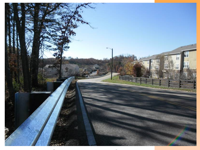
New Guardrail Along Cherokee Trail

Project Description: This project includes installing new signage and guardrail along Cherokee Trail from Cherokee Bluff Drive to Scottish Pike.