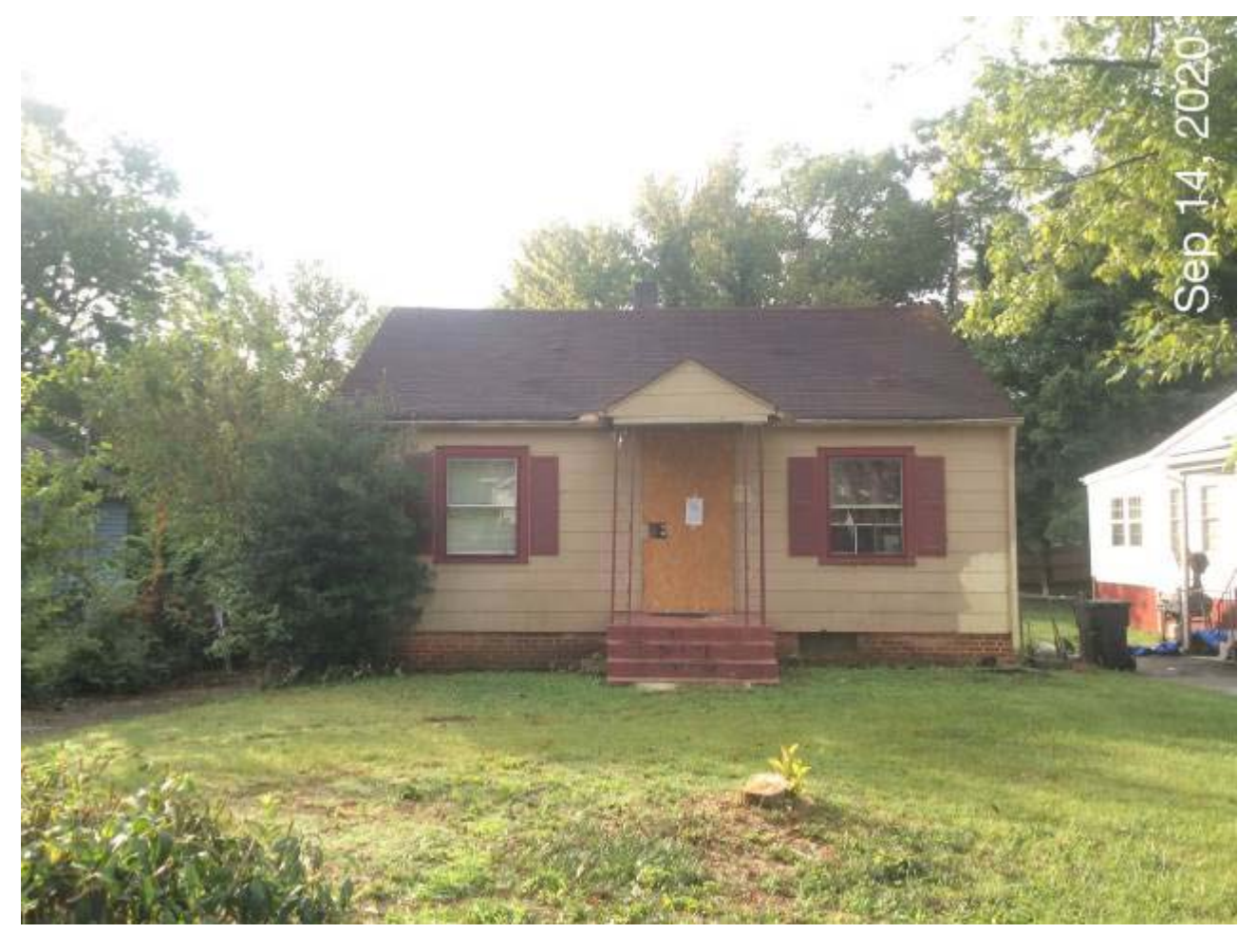
Result: Sixty day repair only order including accessory structure