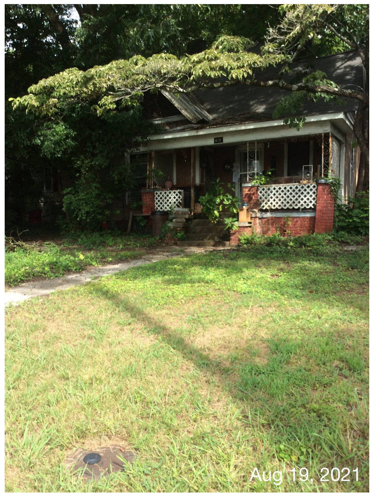
Result: 120 day repair only order including accessory structure