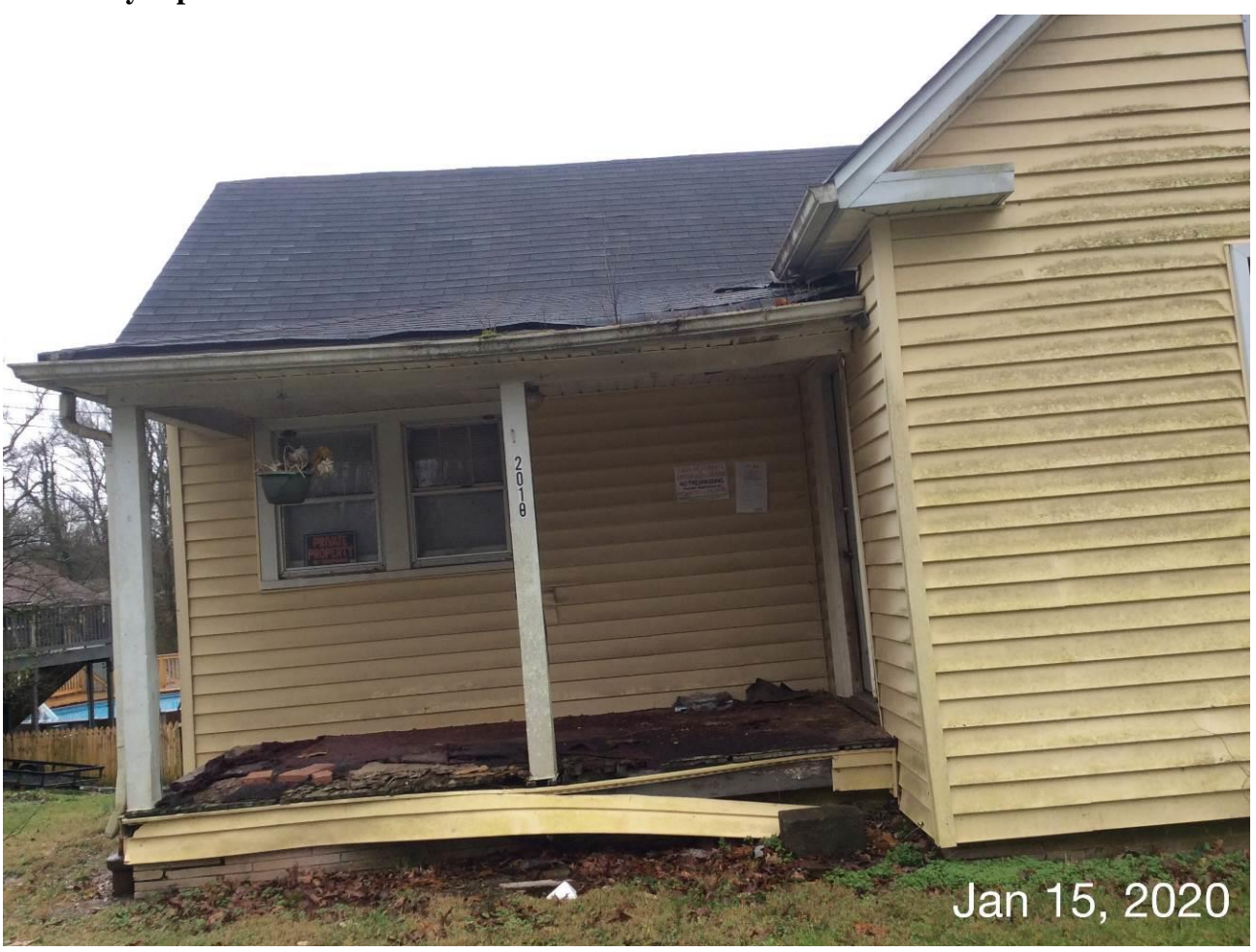
Result: 60 day repair/demolition order