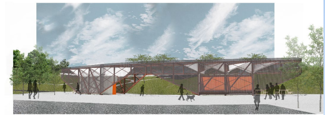
CITY OF KNOXVILLE URBAN WILDERNESS GATEWAY PARK VMM | port | SAUNDERS PACE ARCHITECTURE | KPMG | 2022