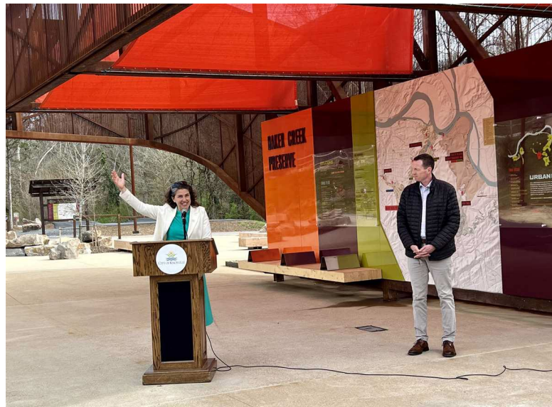
Ribbon Cutting – Monday, March 25, 2024

Project Description: The Knoxville Urban Wilderness Gateway Park Phase Two Baker Creek Pavilion Project is located on the east side of Taylor Road between Tilson Street and Cruze Road near South Doyle Middle School. The project will construct amenities including grading, landscaping, asphalt greenway, concrete plaza hardscapes with architectural finishes, restrooms, supporting utilities & a steel space frame shade canopy.