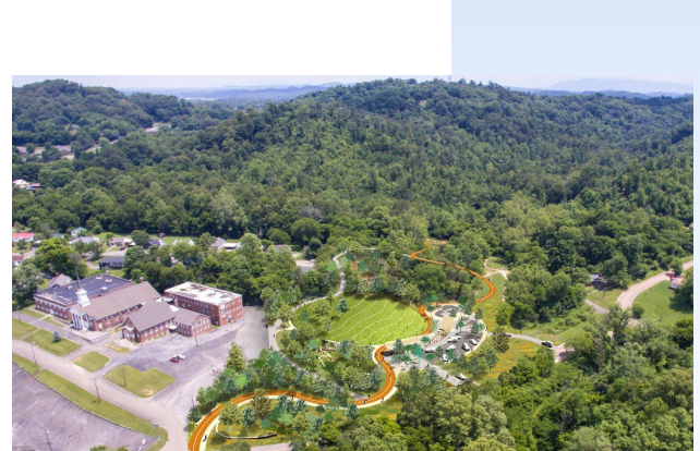
CITY OF KNOXVILLE URBAN WILDERNESS GATEWAY PARK VMM | port | SAUNDERS PACE ARCHITECTURE | KPMG | 2022