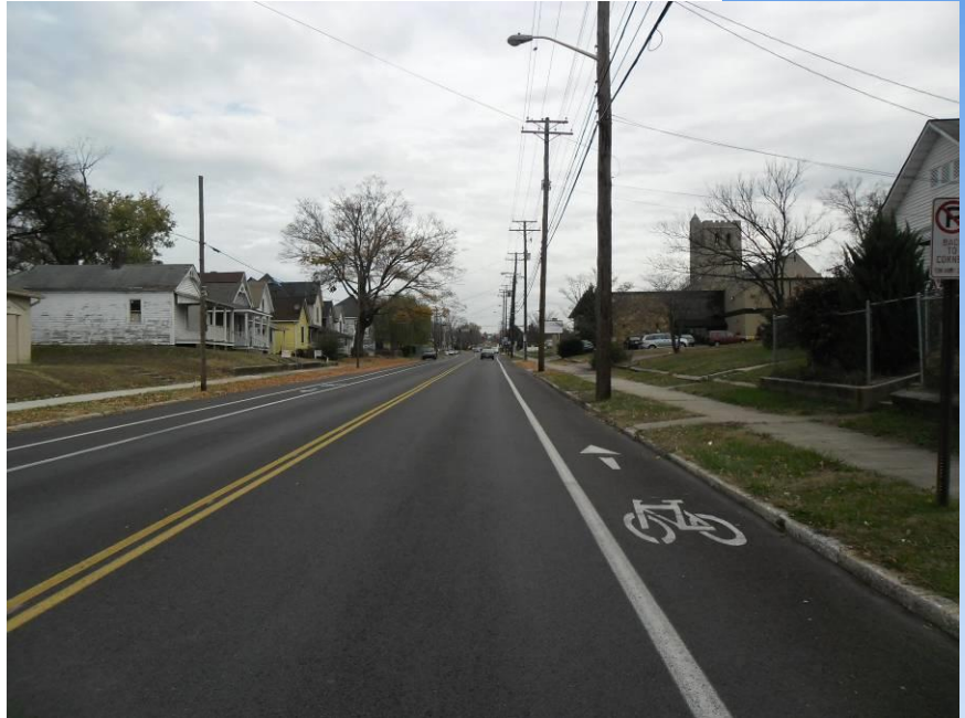
Recent Paving Along Baxter Avenue

Project Description: This project is the City's annual resurfacing program and includes approximately 46.1 equivalent miles of resurfacing citywide. Additionally, in compliance with the Supplemental Memorandum of Understanding and Agreement between the City of Knoxville and Knoxville Utilities Board, and at KUB's request, 17.9 additional equivalent miles have been included for resurfacing streets that were damaged through its utility cuts.