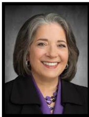
City of Knoxville Madeline Rogero, Mayor