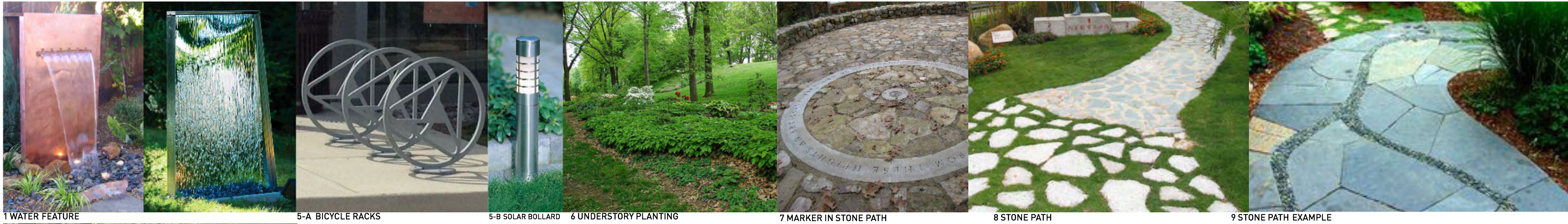
1 WATER FEATURE