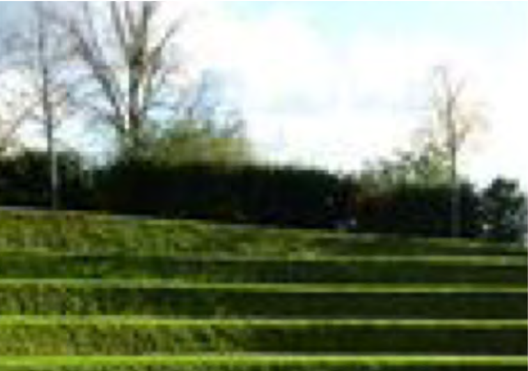
11 MOUNDED GRASS SEATING AREA