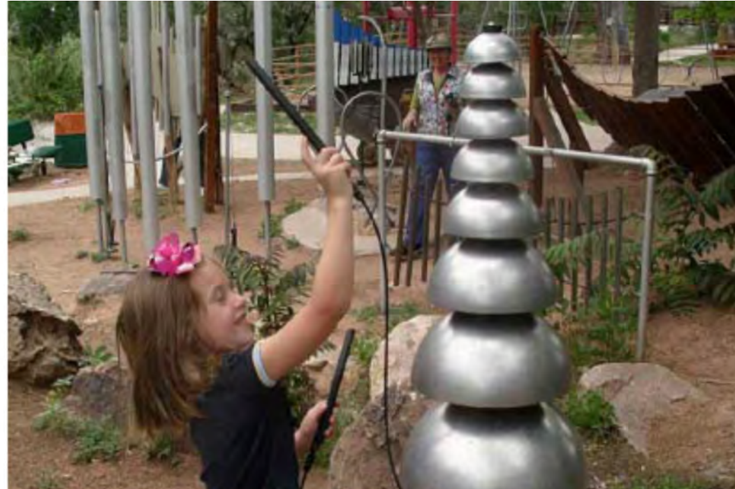
3 MUSICAL PLAY ELEMENTS