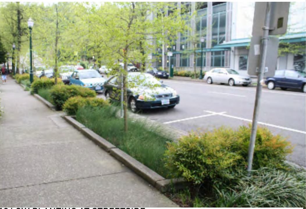
12 LOW PLANTING AT STREETSIDE