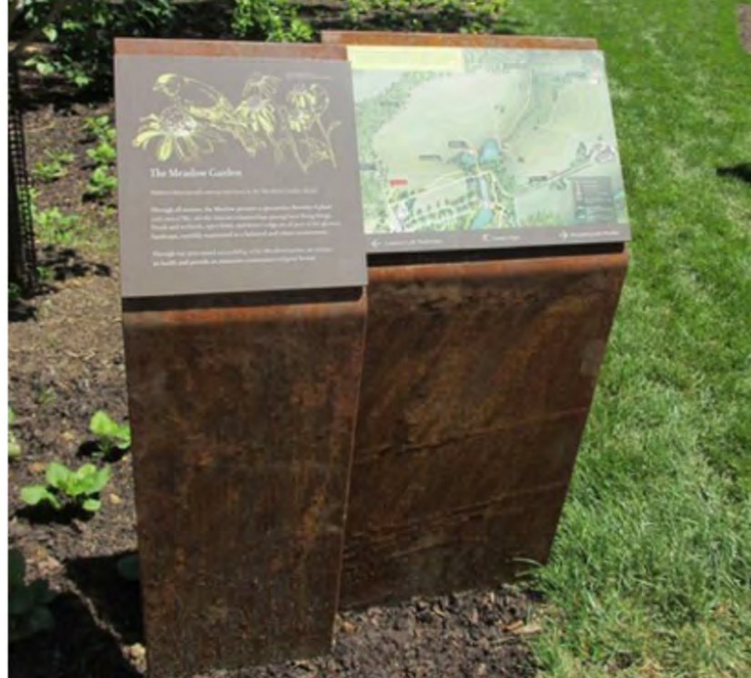
2 INTERPRETIVE SIGNAGE