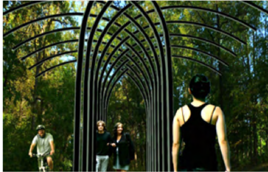
4 GATEWAY EXAMPLE