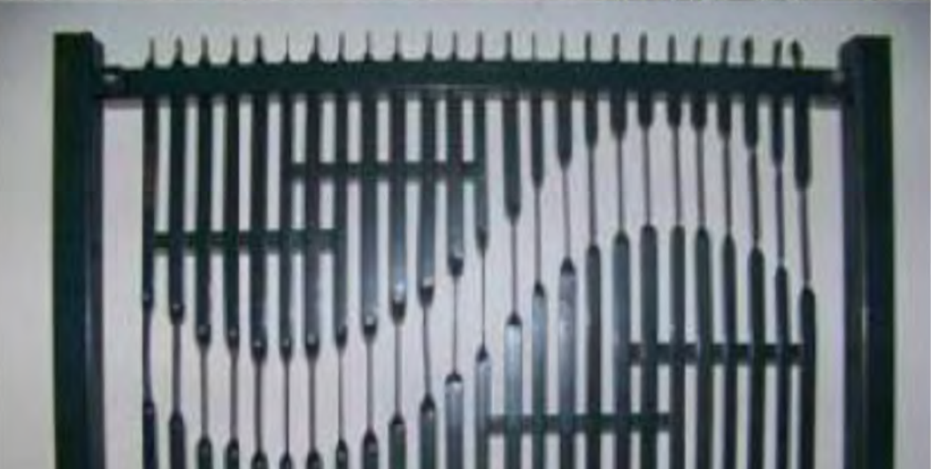
13 DECORATIVE FENCING EXAMPLE