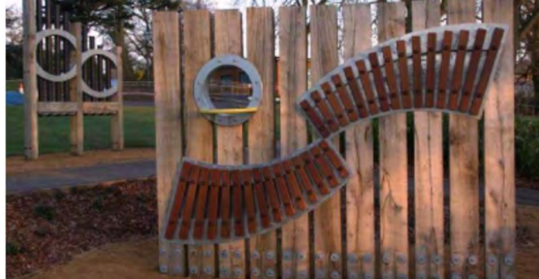
3 MUSICAL PLAY ELEMENTS