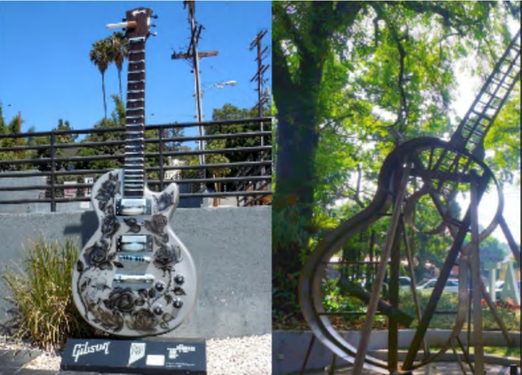
10 INTERACTIVE SCULPTURES