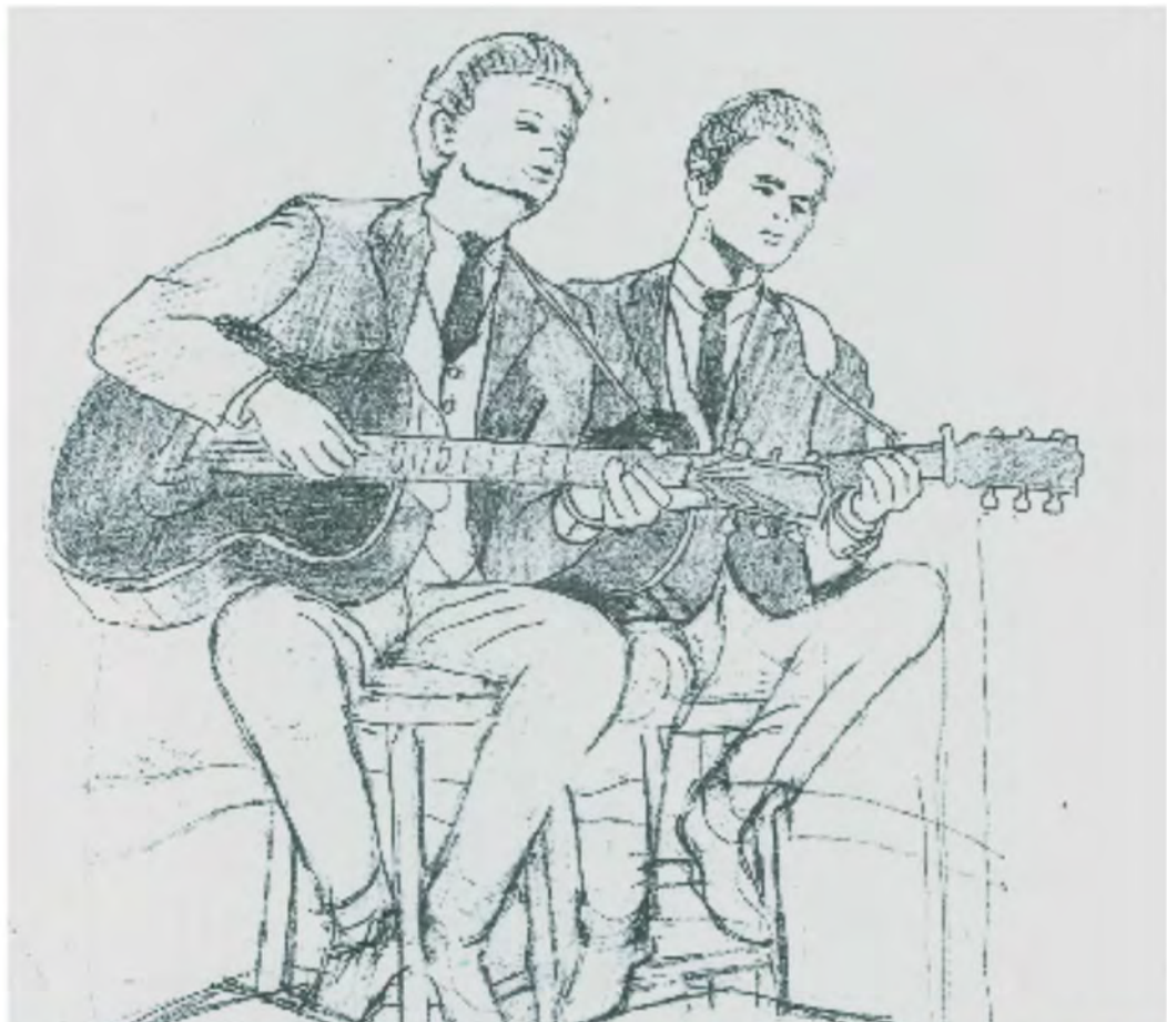
10 INTERACTIVE SCULPTURE EXAMPLE