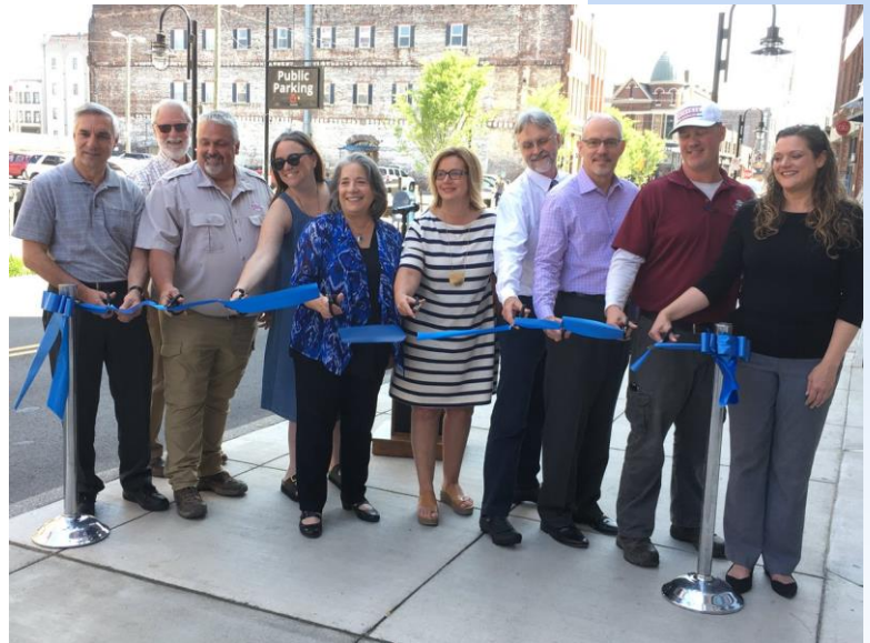
May 24, 2018 Ribbon Cutting Celebrating the completion of two W Jackson Avenue Streetscape projects