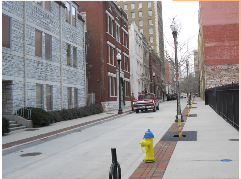
Market Street Looking North – Construction Complete

Project Description: This streetscape project includes the replacement of brick sidewalk on Market Street between Cumberland Avenue and Church Street. This project also includes the improvement of sidewalk on Union Avenue between Market Street and Gay Street. KUB will be providing funding to replace a waterline on Market Street while this work takes place. Other streetscape improvements include adding street trees, decorative brick paver bands, additional on-street parking spaces, and improved lighting. A contract was executed between the City of Knoxville and Design & Construction Services, Inc. for the Downtown Sidewalk Replacement Project.