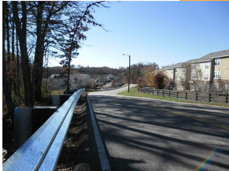
New Guardrail Along Cherokee Trail

Project Description: This project includes installing new signage and guardrail along Cherokee Trail from Cherokee Bluff Drive to Scottish Pike.