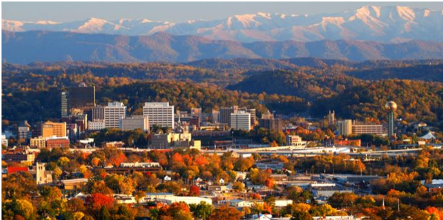
Knoxville in the Autumn