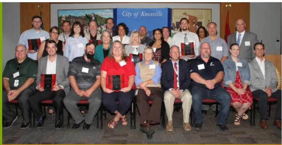
Diversity Business Enterprise Awards Breakfast