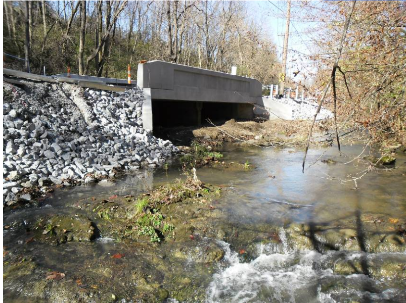
Repaired Loves Creek Road Bridge

Project Description: This project will consist of repairing and updating the substandard features of an existing slab bridge over a branch of Loves Creek.