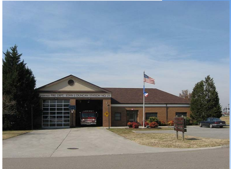
John J. Duncan, Sr. Fire Station #21 245 Perimeter Park Drive